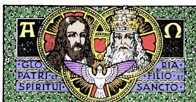
Answer to puzzle on front page: Three Persons in One God.

Sometimes we can understand the Holy Trinity as if it were like a family. Each of the persons is different, but the family wouldn't really exist if any one of them were missing. The Holy Trinity is also a relationship of love. Because God is so full of love He wanted to share it with others, so that is why He made us! When we live the way God wants us to we are joining in the life of the Holy Trinity. Isn't that amazing?